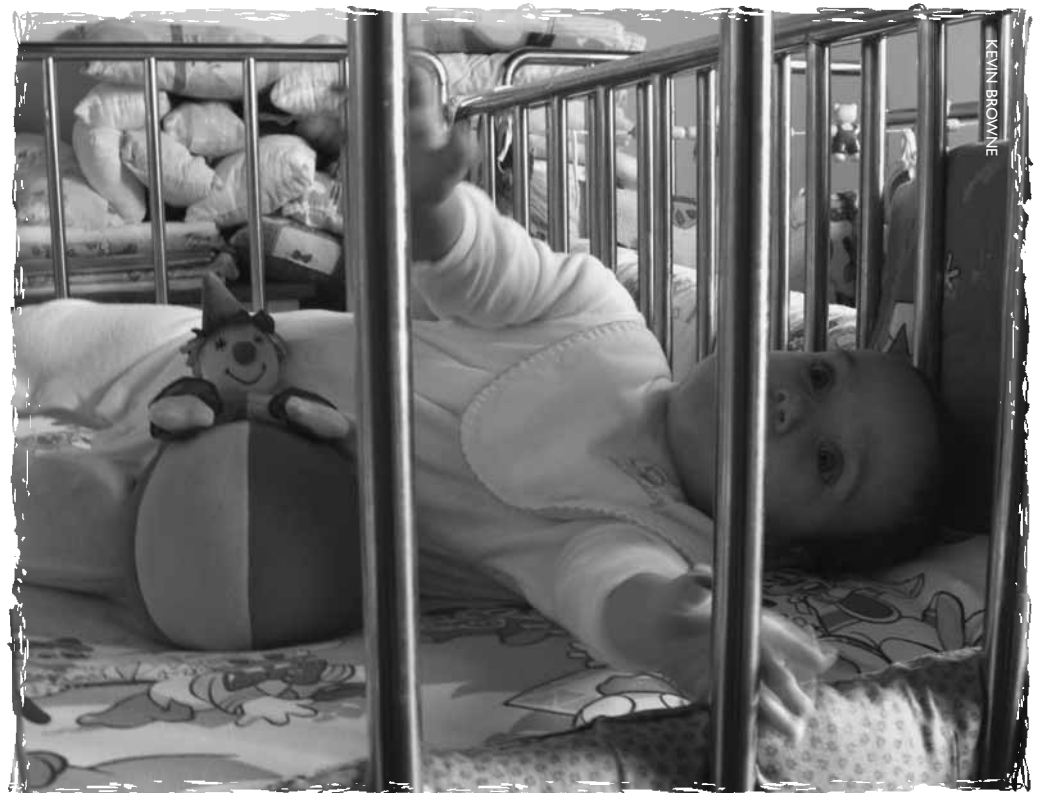
Plate 2: A young child in residential care at a 'children's home' in Montenegro

Much emphasis is placed on infection control, and the children experience the outside world only on rare occasions under strict supervision and limited play. The everyday contact with dirt, which challenges and helps develop a child's immune