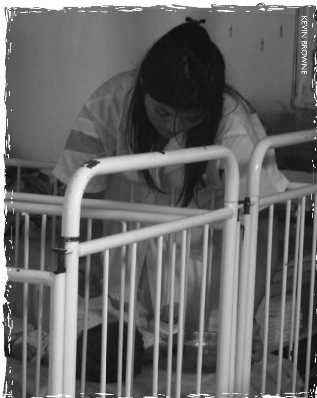
Plate 1: A young child being fed inappropriately in his cot.

Residential care implies an organised, routine and impersonal structure to the living arrangements for children (eg, all children sleep, eat and toilet at the same time) and a professional relationship, rather than parental relationship, between the adults and children. It is recognised that this definition would include children admitted to hospital, children in emergency care and those who attend boarding schools and summer camps. Therefore, children