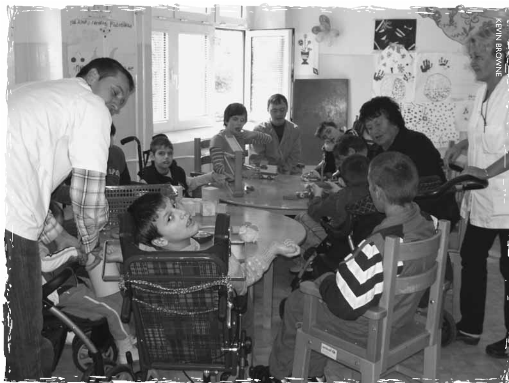
Plate 4: A pilot day care scheme to prevent children entering into institutional care within Montenegro

international adoption is rarely the last resort that it is proposed to be (UNCRC, 1989 Article 21). In fact, research has shown that international adoption is associated with an increase in the numbers of children in residential care rather than a decrease in both sending and receiving countries (Chou and Browne, 2008).