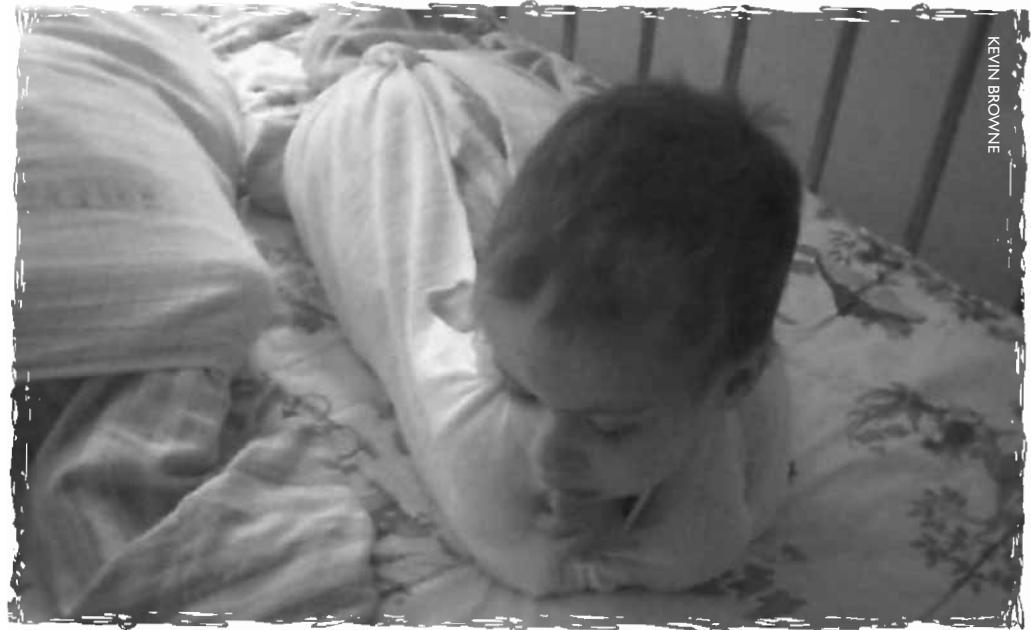
Plate 3: A two-year-old girl tied up in bed clothes to prevent her scratching and pulling hair in a Serbian children's home